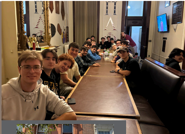
Brothers enjoying fratsgiving

This past semester was great for the chapter and morale of brothers. Brothers of Pi Lambda Phi remain active in philanthropic endeavors in order to help keep the city we live in clean and to give back to those in need. We brought back the Fratsgiving tradition this semester, where brothers came together and cooked individual dishes from respective units.