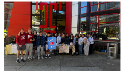
Brothers of Pi Lambda Phi and members of Alpha Xi Delta

This semester, all of our philanthropy proceeds went to the Special Olympics Foundation. We held numerous philanthropic events, like Pie a Pi Lam, Phried Oreos and the Fall bake sale with Alpha Xi Delta.