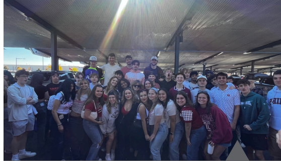
Brothers of Pi Lambda Phi and members of Alpha Epsilon Phi at homecoming

FOR THIS YEAR'S TEMPLE HOMECOMING GAME AT THE LINC, WE BROUGHT BACK THE TRADITION OF PARENTS DAY. WE WOULD LIKE TO EXPRESS OUR GRATITUDE TO EVERYONE WHO PROVIDED FOOD AND DRINKS FOR THE EVENT. MEETING EVERYONE'S PARENTS WAS FANTASTIC, AND THE OWL'S PASSING HAD NO BEARING ON THE WONDERFUL TIME THAT EVERYONE HAD. WE ARE EAGERLY ANTICIPATING THE HOMECOMING NEXT YEAR AND WILL UNDOUBTEDLY CONTINUE THE TRADITION.