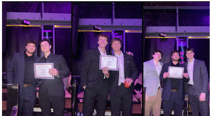
Pictured here are some of the superlatives from the formal event