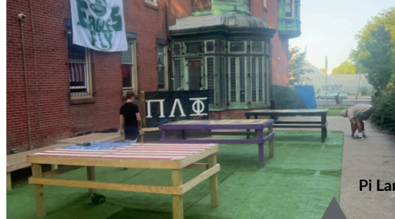
Pi Lambda Phi backyard

Over the summer, brothers started moving into the new house. Quickly, this new location became home. Brothers were active 24/7 and were soaking it all in when we first moved in. Ever since then, it's been nothing but hard work, fun and camaraderie. This new house is a symbol of the brotherhood and an opportunity like no other.