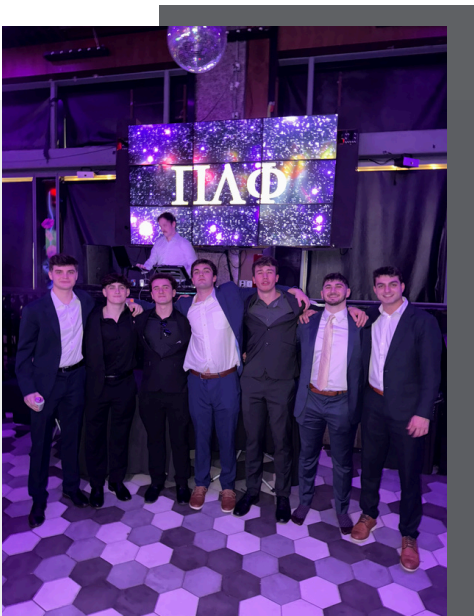
The new Executive Board for 2025

The 2024 Pi Lambda Phi formal event was held at Pace and Blossom this year. It was a great time to unwind with brothers and have a good time before finals.